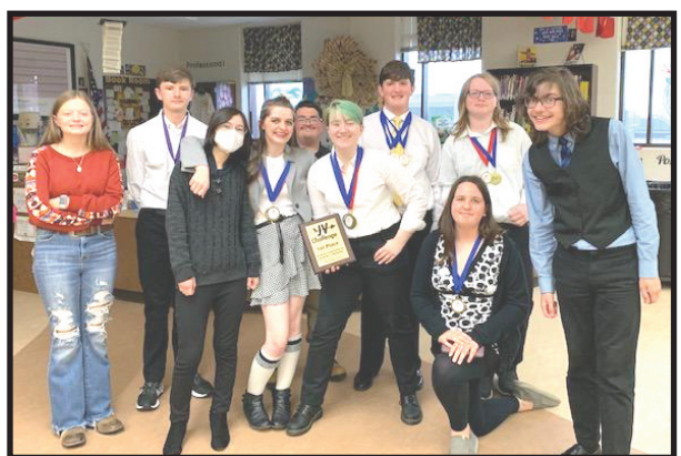
The Panthers pose with their championship plaque and individual awards

The Fleming County High School Academic Panthers continued their outstanding early season run with an overall Section 10 championship. The Panthers entered their JV Challenge Sectional competition as a favorite, despite a very strong field, and exceeded those lofty expectations. The competition, limited to freshman and sophomore participants, had Fleming squaring off with regular Limestone League opponents: Rowan, Mason, and Montgomery Counties, and 10th Region competitor Pendleton County.